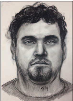
Police sketch of suspect.